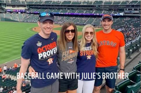
BASEBALL GAME WITH JULIE'S BROTHER